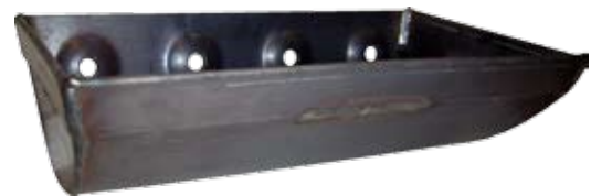
Starco Jumbo 8 elevator buckets in a welded version (parameters in mm)